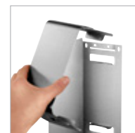
Mounting the enclosure on the base plate (right open)