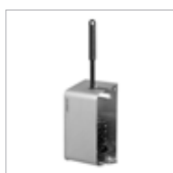
Side panel variably mountable