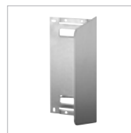
Optionally mountable differently: base plate, left open and right closed