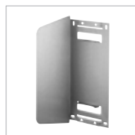
Base plate for left closed and right open mounted