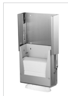
Paper towel dispenser movable downwards together with guide rail